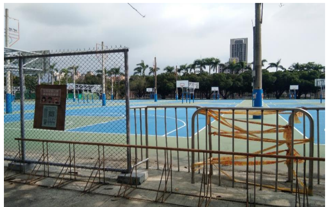
Aside from the main gate, all entryways to the university were blocked [left]. All facilities for public use were closed [right].