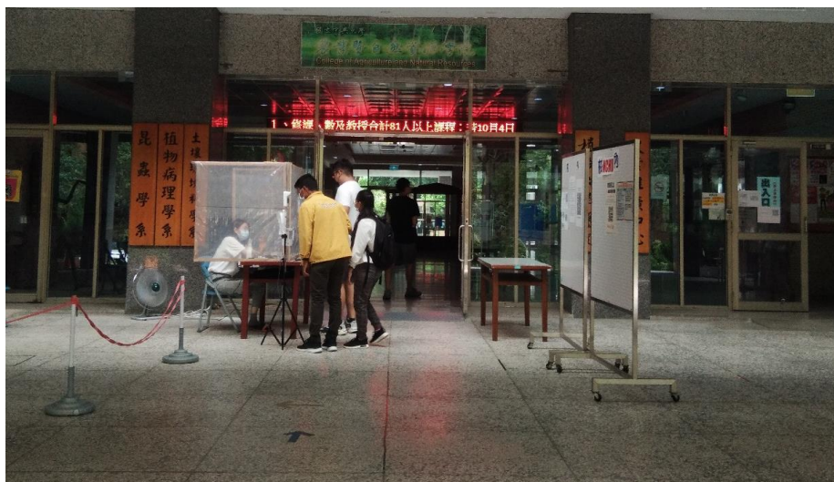
Body temperature and disinfection station at the entrance of the Agriculture and Natural Resources Building