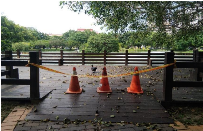
Benches near the NCHU lake were blocked to prevent people from gathering in this area.