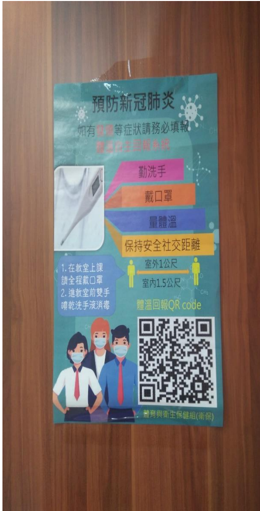
Figure 8: Warning Poster

To further support the policy to prevent the spread of the virus, the campus provided alcohol and posters warning the use of masks and social distancing in almost every corner of the room. It always aims to remind building users of the importance of applying the precautionary principle.