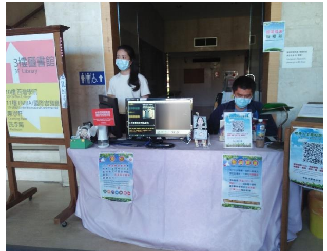
Figure 2: Identity check table