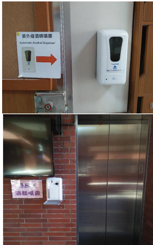
Figure 9: Alcohol liquid in numerous angles

On May 15-July 26, 2021, through the Taiwan Centers For Disease Control (CDC) official website, Taiwan imposed a level 3 alert due to a sharp increase in Covid-19 cases (CDC 2021), which prompted the NSYSU campus to tighten the implementation of its health protocols further. In collaboration with various departments on campus, the policy rules for preventing the spread of Covid-19 were disseminated through various media. One example of effective dissemination of information is via email. The Office of International Affairs (OIA) is the primary division to convey these policies for international students.