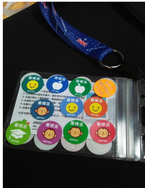
Figure 5: Announcement Regarding sticker