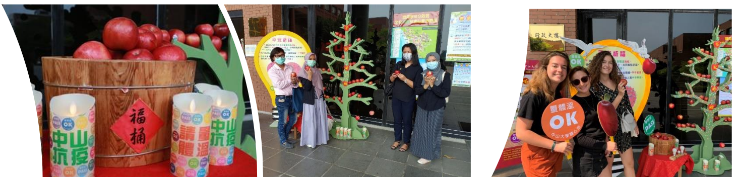
Figure 7: Apple Prize, Apple Tree, and International Student Enthusiasm

The sticker application system is quite unique for the academic community. In making this sticker system more attractive, the NSYSU campus also implements a sticker exchange program with prizes in the form of Apples, Chocolates, or other foods.