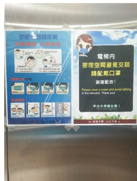
Figure 4: Warnings for wearing masks

In addition to the policies mentioned above, the NSYSU campus also applies a sticker system. This system aims to monitor further the entire academic community and outside parties