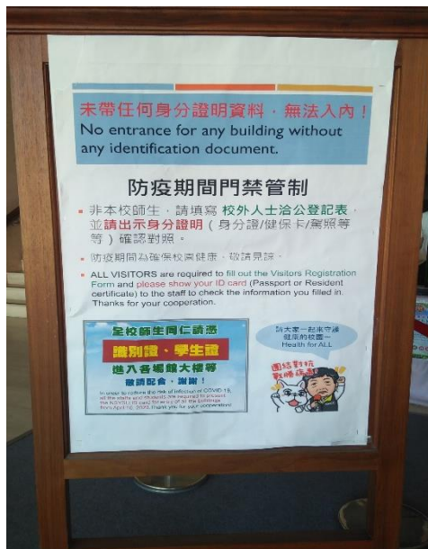
Figure 3: Announcement of Identity Cards